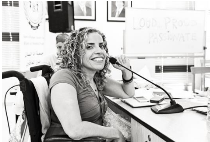
A disabled woman activist from Jordan.

People with disabilities themselves play a critical role in making the laws widely known, implemented and enforced.