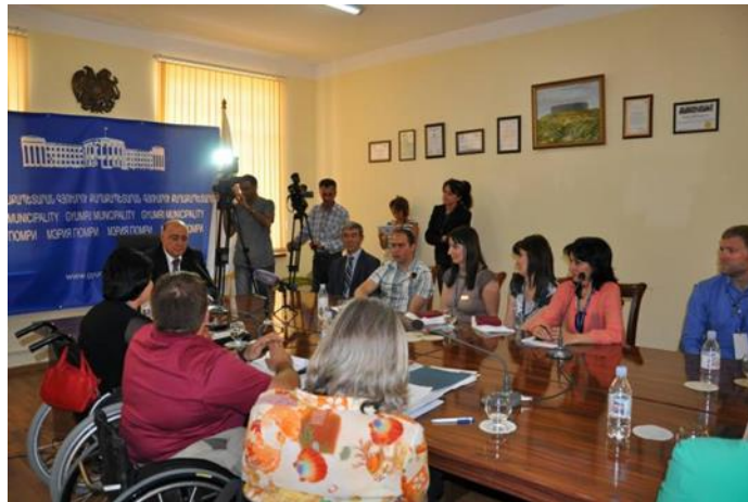
The Mayor of Gyumri, Armenia meets with disability advocates in 2014.

High-level law and policy makers and people of influence can act as critical champions for your cause