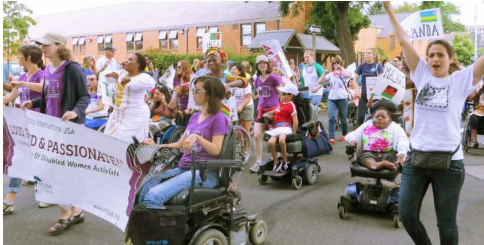
WILD participants from around the world gather to march in the Women's Day parade.

Social movements are able to create critical mass and sustainability by developing inclusive goals with other social movements