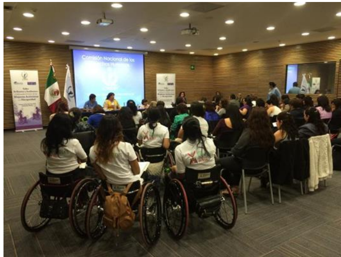
A conference in Mexico includes audience members with and without disabilities.

People with disabilities have a right to participate in a full range of life activities, free of discrimination from any organization, business or entity that provides goods or services