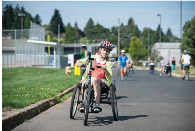
A young woman with a disability enjoys adaptive biking.